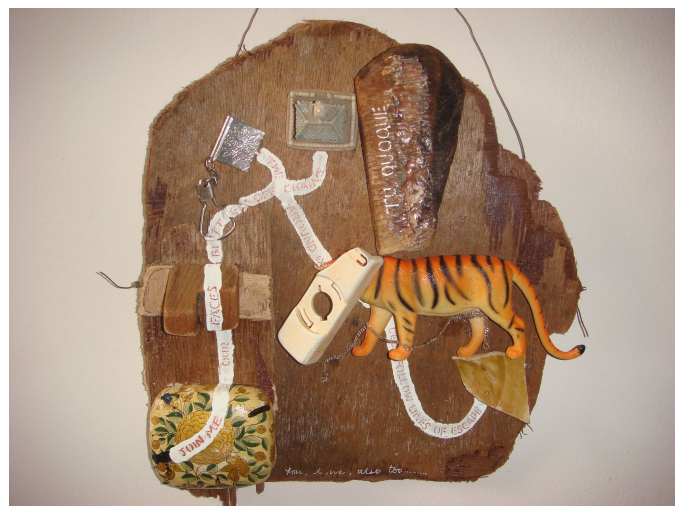
Tu quoque, 2010