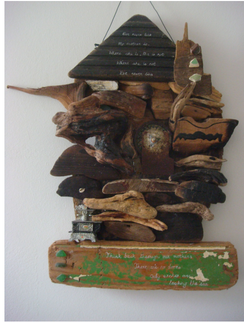
Mother-as-house , 2011