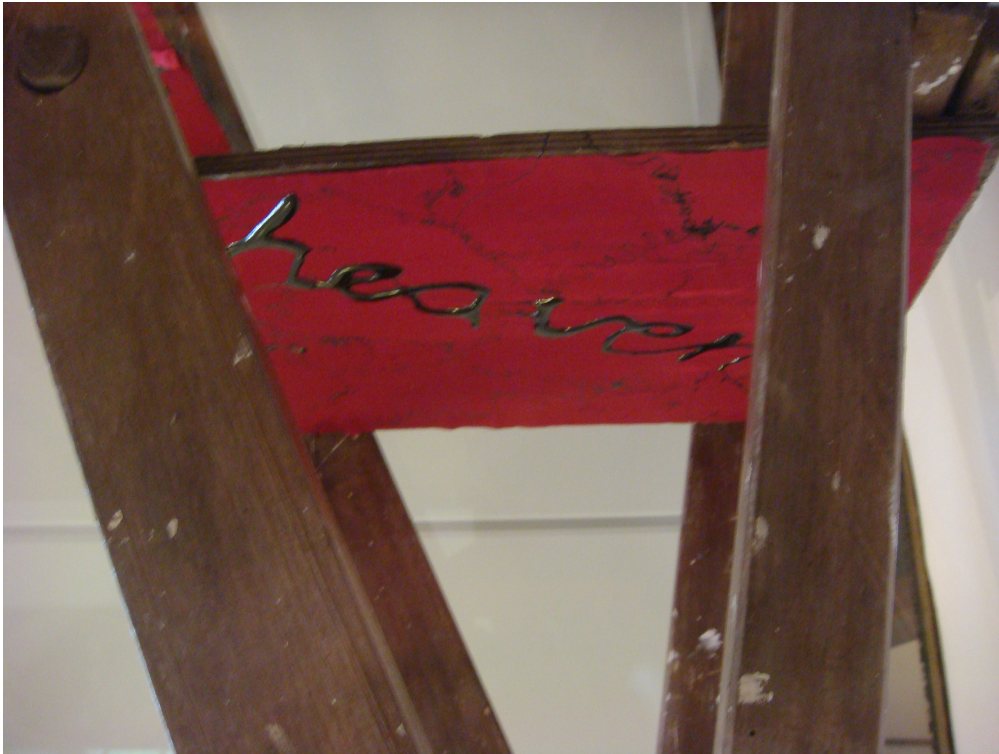
Three Steps to Heaven , stepladder, silk and bitumen paint, 2013