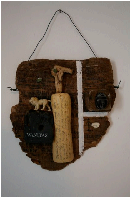
Vanitas , 2010