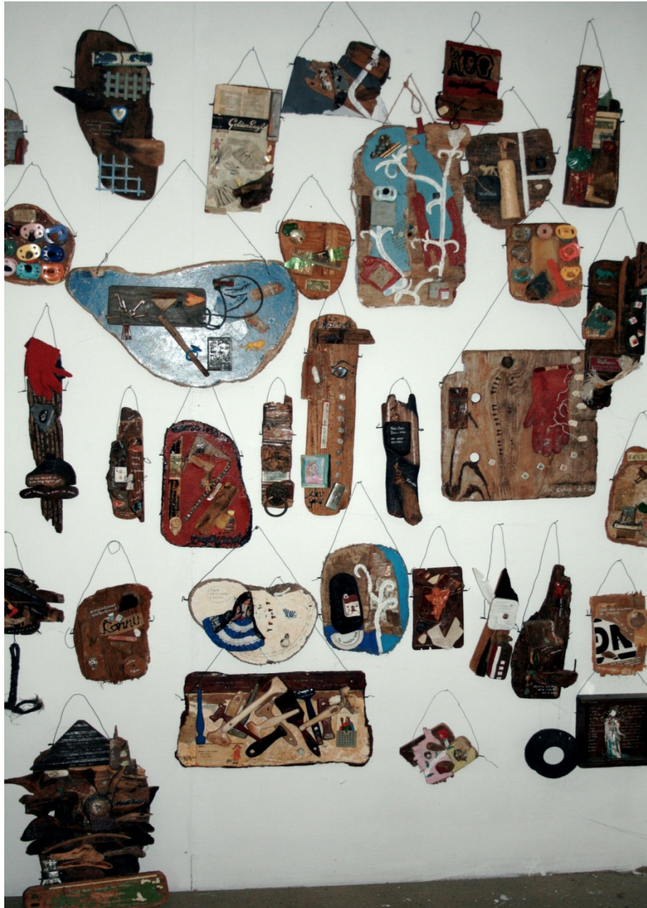
Marazion Drill Hall Studio, 2010