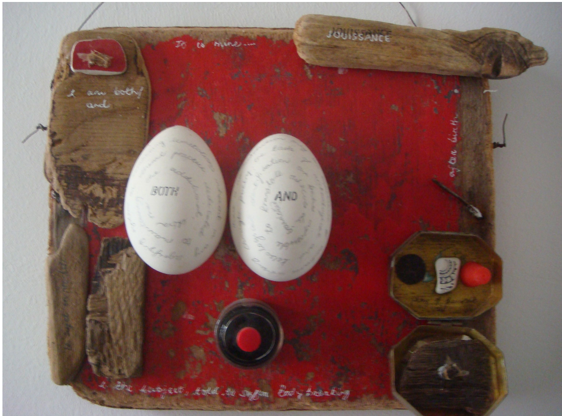
Jouissance , 2012