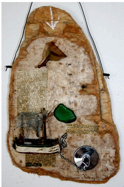
Crochu ou Busqué, 2008

I am fascinated by interpretation, and how communication is possible through different media and languages. Objets-textes come into being with the possibility of being 'read', yet they are at once a 'laboratory, workshop, forum, a 'nuptial chamber', (Conley, p77). I would like to align myself with Cixous' project of multiplying meanings. Modes of inscription, and arrangement of space are meaning articulated in visual configurations which corrupt the purity of words, invite interpretative mobility, permeable frames, and ambiguity.