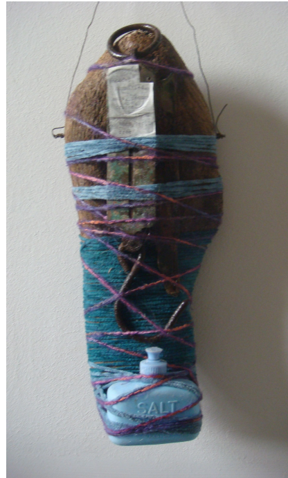
Corps d'Elle, 2010