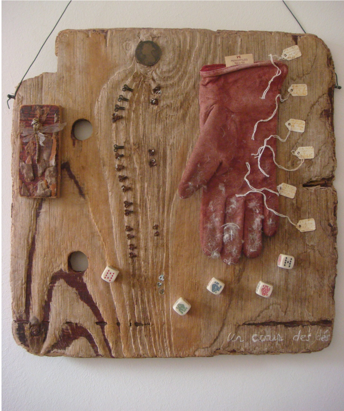
Un coup de Dés, 2009

compelling ( borrowed from Walden, D., (1992) and hope like Max Ernst to find 'fortuitous encounter upon a non-suitable plane of 2 mutually distant realities' (Walden, D., (1992) and by this means convey moments of intuition, and emotion to trigger image, text and association - beyond the sway of conscious faculties.