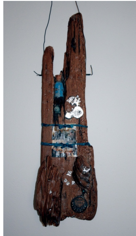
Vermeer, Vers-mer, Vers-mère , 2010

I not only draw on written word play by Cixous, but also on Surrealists, Irigaray, and Deleuze....the engagement with materials, the interplay of concepts, and personal narratives, is a seductive process. I spend hours playing, selecting, rearranging, thinking and making, and whilst each individual objet-texte assemblage might look deceptively simple, they are deeply personal works, in which I perform 'myself' in many ways.