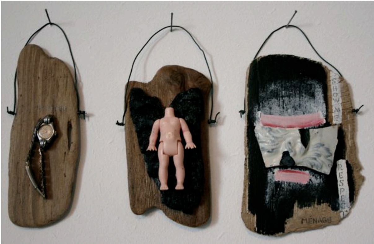
Respect Triptych, 2011

'I want to name some of our pains. I want to keep our names. I know that neither images nor words can escape the drunkenness and longing caused by the turning world. Words and images drink the same wine. There is no purity to protect.'