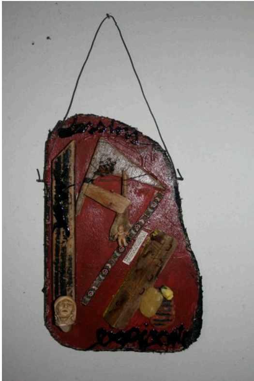
Episcate , 2008