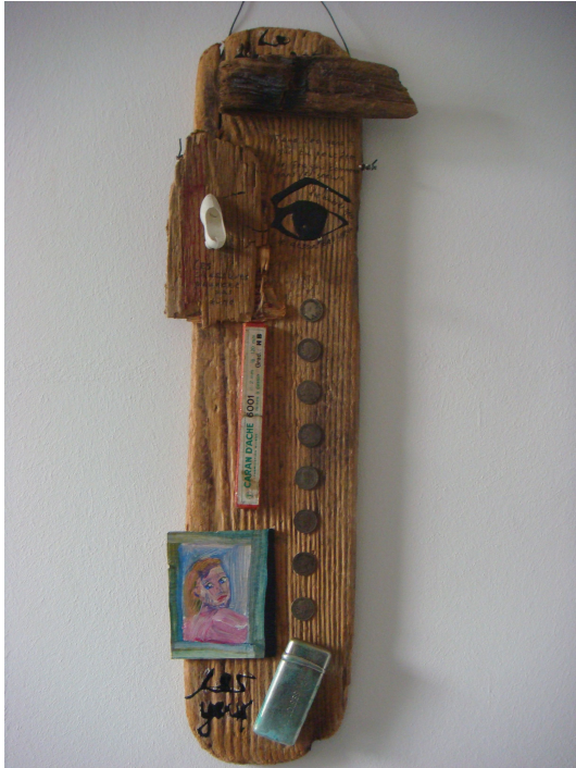
Caran d'ache, 2009