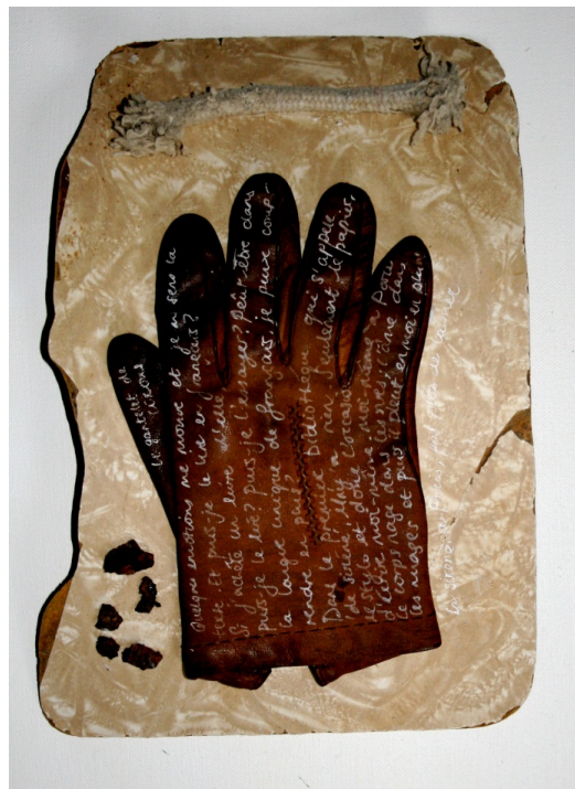
La Recherche pour Cixous, 2011

http://www.pushandpull.com.au/2009/06/09/objects-of-experience-stein-meets-whitehead-meets-olson-meets-kaprow-you-me/ (27/2/12)