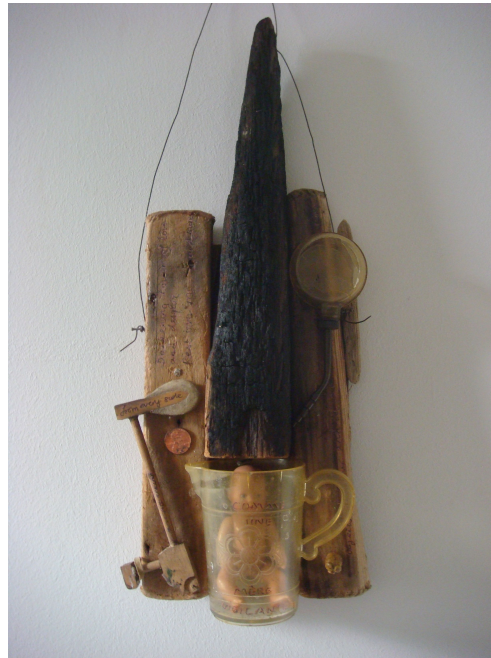
Comme une Mère Vigilante , 2011