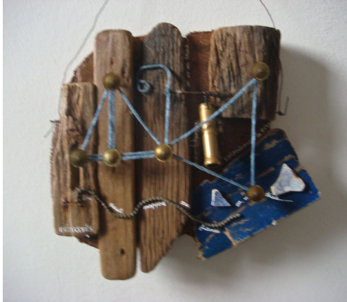
Dépassés , 2010