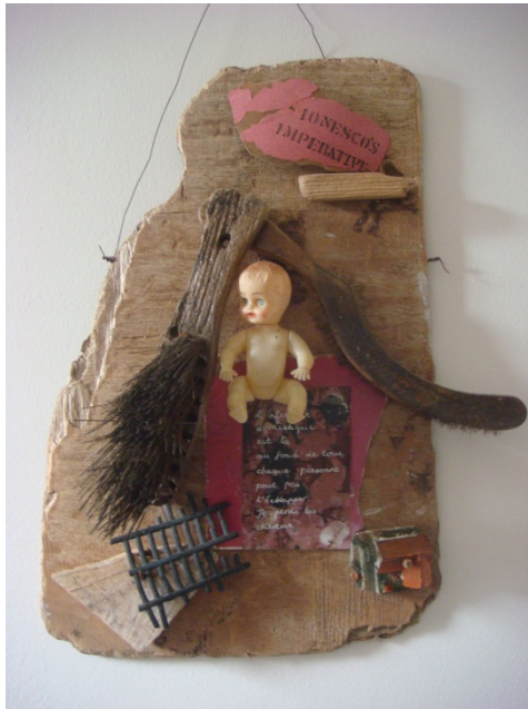
Ionesco's Imperative , 2010

This book is a small collection of some of the research and writings in which over this period of making I have tried to understand why I 'write on things...'