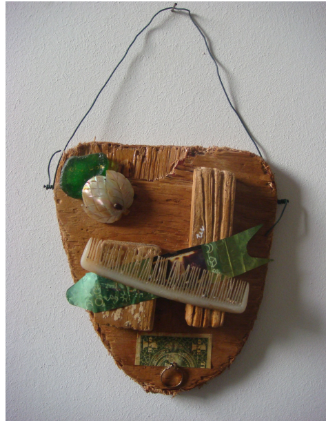
Comb my heart , 2009

'Transpersonal meaning-giving structures' (Derrida, in Lyas, 1997, 'p167,)), hint at the possibilities of projecting meaning. Yet meaning is always elusive. We rely on the hope that some sort of 'seventh sense' exists (Addison, in Herwitz, 2008), and that the imagination synthetically fuses properties of art objects, actively putting the elements together into a special kind of 'uniform whole'.