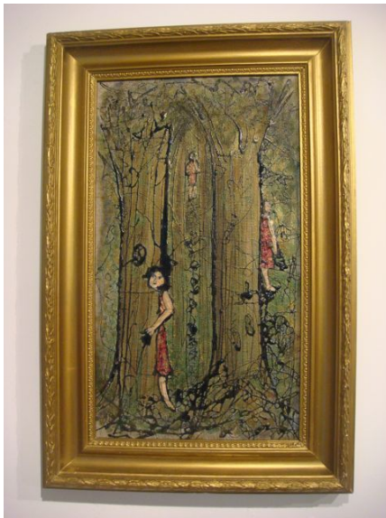
Les habitants du foret du lui-memes (inhabiting the forest of the self)

Oil and bitumen paint on Italian linen with gold frame