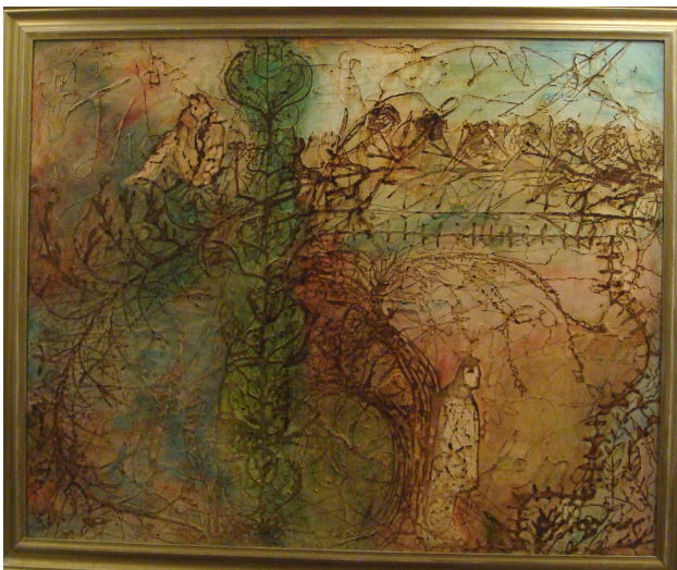
The back of dreams,

bitumen and oil paint on canvas, with gold frame