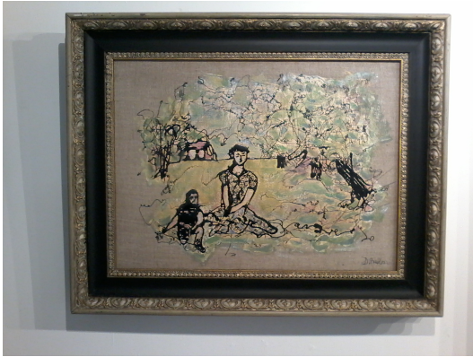
Pas du dejeuner (no dinner)

Oil and bitumen paint on Italian linen with antique frame